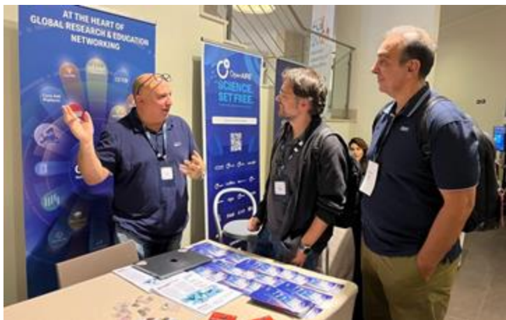
Joint booth at the EGI Conference in Lecce, Oct 2024